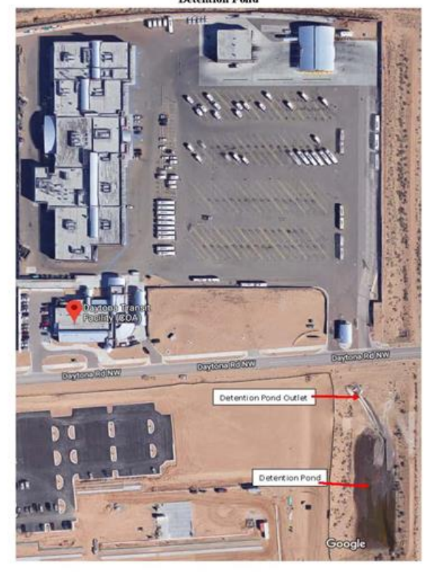
City of Albuquerque, Daytona Transit Facility Detention Pond